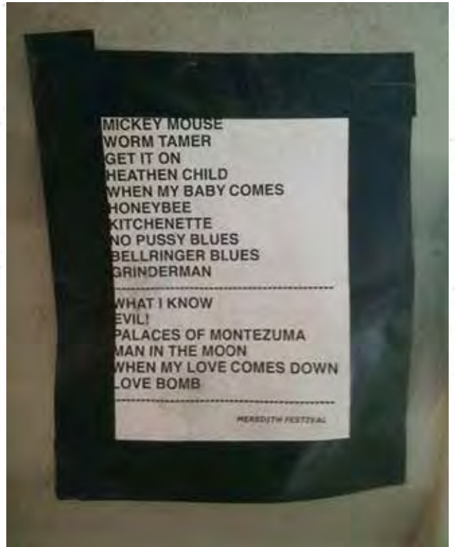
ABOVE: 2011. Grinderman blast The Sup', then announce that's the end of them.

BELOW: 2011. Grinderman arrive to a huge reception.