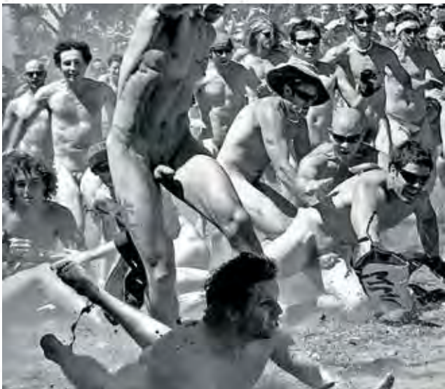
ABOVE: Sadly this big old radiata pine tree is reaching the end of her life. We think this will be the last Meredith for her. Will be very sad to see her go. LEFT: The Gift was much more chaotic before The Town Bikes.