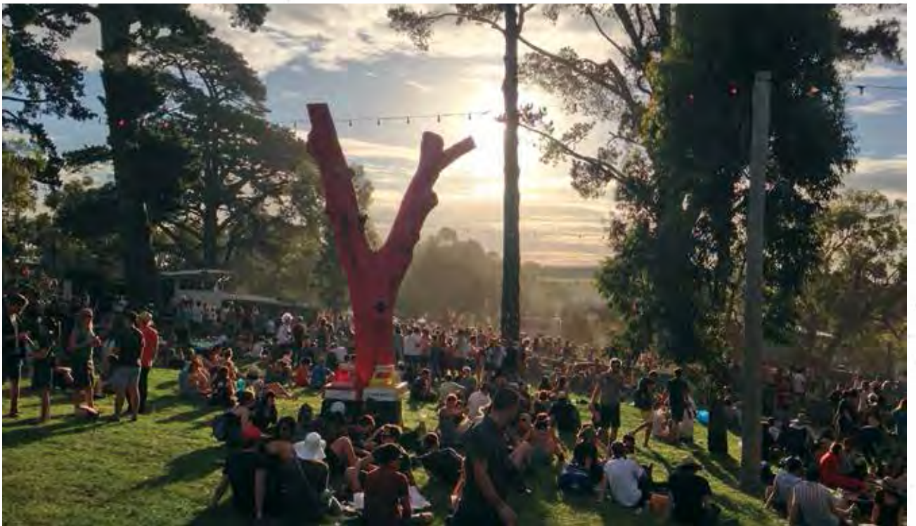
ABOVE: 2012. (The Red Tree is silver this year, for The Silver Jubilee.) BELOW: The Town Bikes directing The 2012 Gift.