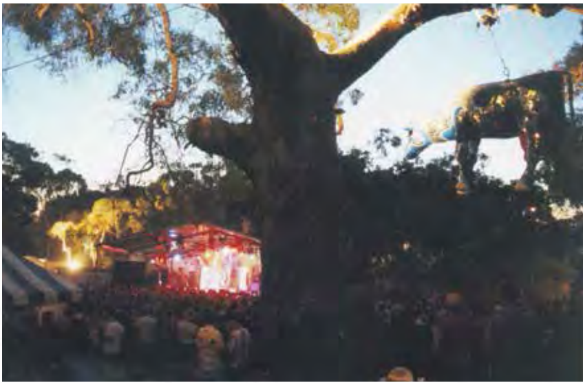
LEFT: 1998. Cow-shaped mirror ball in the breeze at sunset.

BELOW: 1999. Primitive prototype of Meredith Sky Show. That year's mascot, a dragonfly, re-created at giant size and intended to 'fly' along wire from big tree to stage at midnight. It flies terribly, unnoticed, and stalls halfway. Stays there all festival.