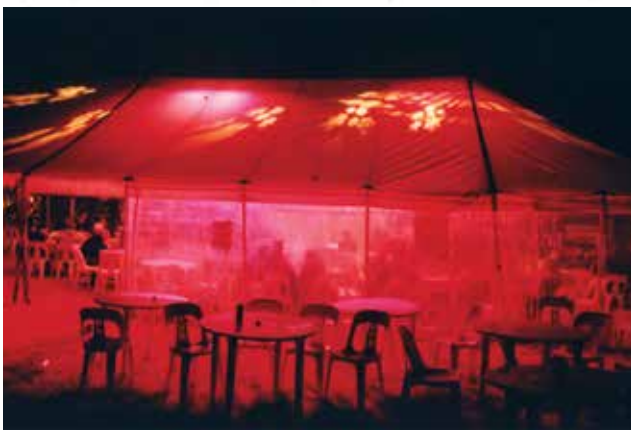
ABOVE: 1998. The Pink Flamingo Bar re-opens after being shut since 1962.