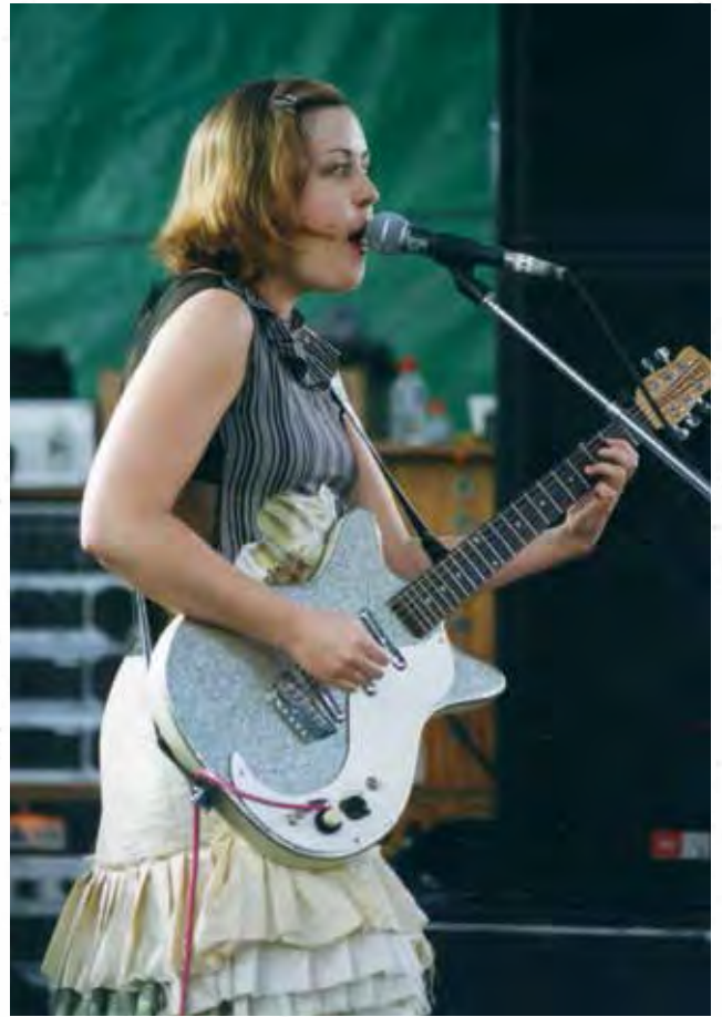
ABOVE: 2002. Sleater-Kinney.