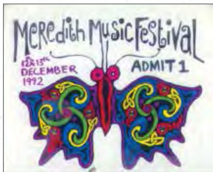
ABOVE: 1992. The ticket.