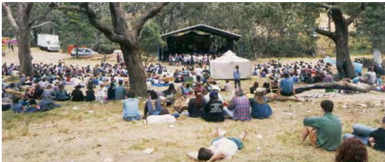
ABOVE: The Meredith Natural Amphitheatre in 1993. Long before the festival had to move and become Supernatural.

LEFT: The stage in action in 1992, the second year of Meredith. This is the earliest photo we have of the Amphitheatre.