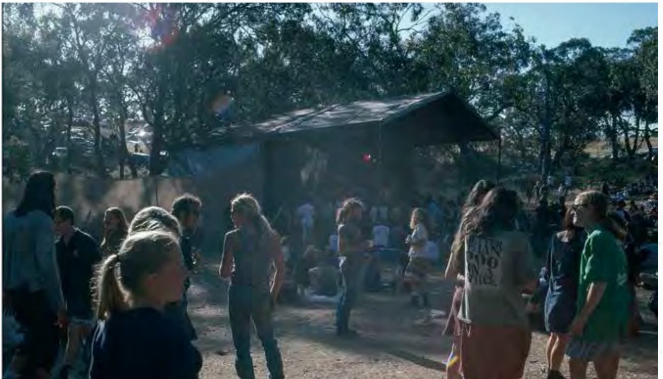
ABOVE: Meredithians, 1993.