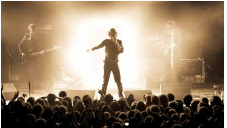
BELOW: 2010. Sky Show. Spaceship hovers above The Sup'.