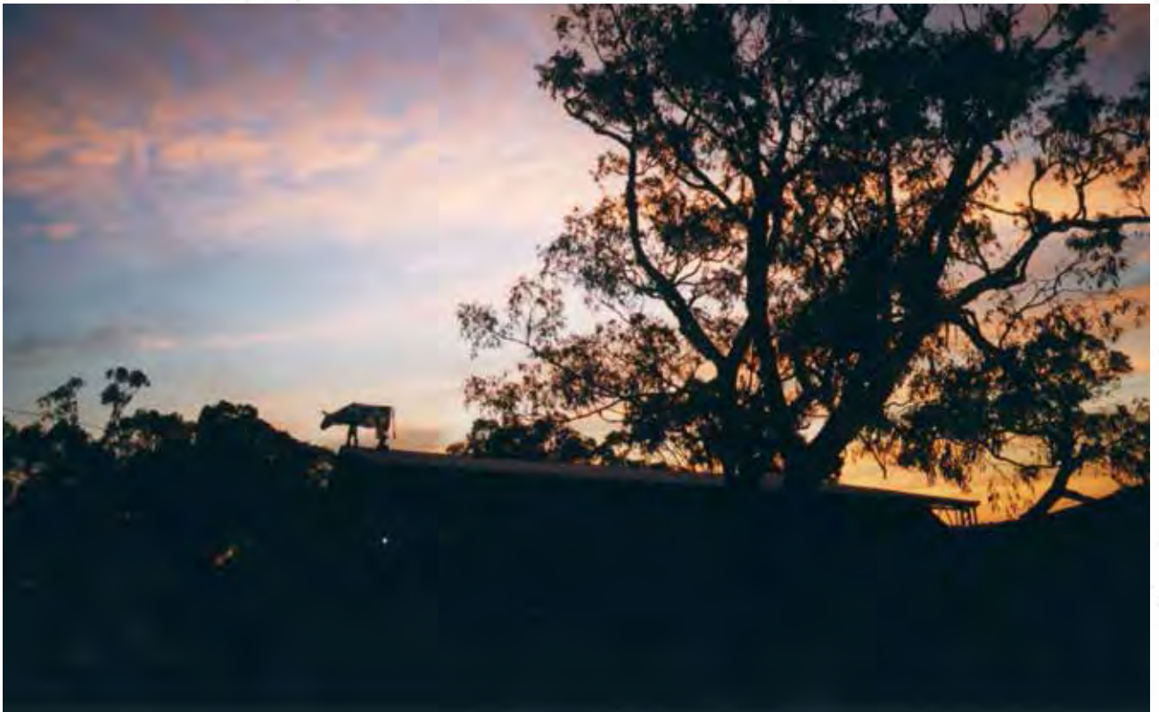
BELOW: The cow found a spot on the crest of the stage roof. Hood ornament.