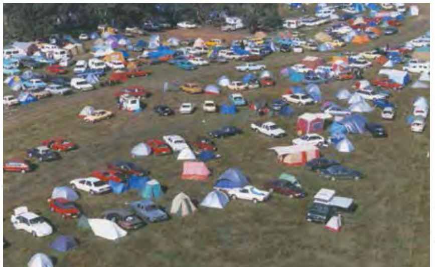
LEFT: 1995. ABOVE: 1995. Tents have changed, cars have changed.