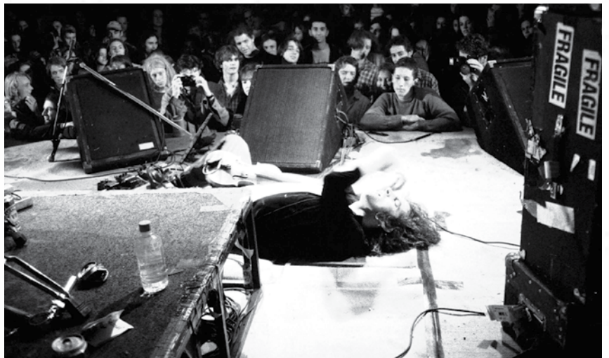
BELOW: Esky from 1995. Rock n roll all night.