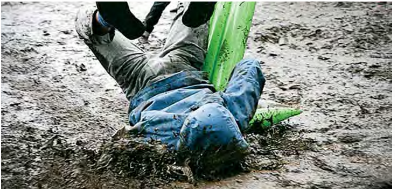
ABOVE: 2008. Extensive drainage and pathway works were carried out after this festival.